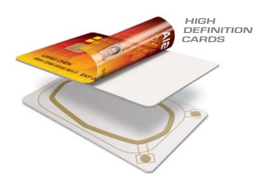
High Definition cards deliver the highest image quality layered on the highest functionality. HDP Film fuses to the surface of proximity and smart cards. It conforms to ridges and indentations formed by embedded electronics, and provides an extra layer of card durability and security.

Cards produced by High Definition Printing are inherently more durable and secure than other types of cards. They resist wear and tear by putting a durable