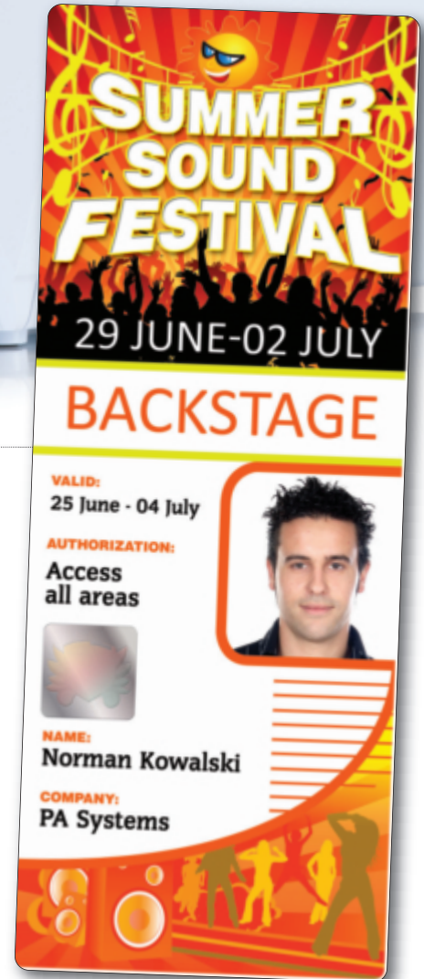
STANDARD CR80 CARD

Magicard's patented HoloKote® security technology adds a watermark to the card as it is printed - it requires no additional consumables and can be customized to an individual logo design - enabling true security at no extra cost.